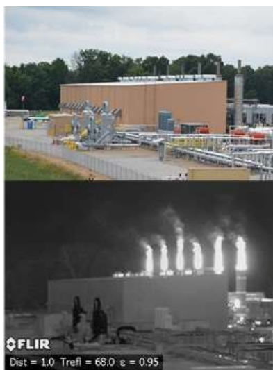
Earthworks - Compressor station emissions containing VOCs made visible with a FLIR Camera

What are VOCs? Organic compounds are chemicals that contain carbon and are found in all living things. Volatile organic compounds, referred to as VOCs, are organic compounds that easily change from liquid to vapors (fumes) or gases at room temperature. They are emitted from oil and gas sites including but not limited to well pads, compressor stations and pigging stations. Diesel trucks which go back and forth from sites are big emitters of VOCs. VOCs are also released from liquid fuels such as gasoline or kerosene, as well as from burning fuel such as gasoline, wood, coal, or natural gas. Additionally, they are released from solvents, paints, glues, and other products that are used and stored at home and work.